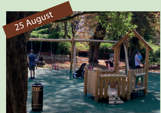
Playground improved for Under Fives