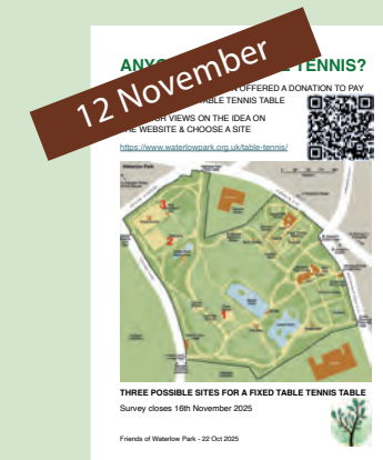
Table Tennis Table donated. Public engagement held.

Besides occasional emails to members of the Friends, regular news posts are put on the website and on X (formerly Twitter). Reciprocal posts and Followers would be welcome on X @waterlowpark.