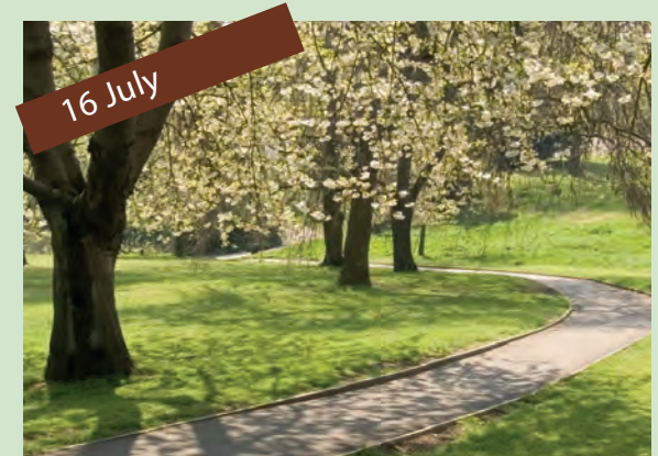
Borough rejects call to make BBQ ban permanent

And finally, after much cogitation, an acceptable styling was devised to achieve a level entrance for all from Highgate High Street, especially welcome for prams and buggies.