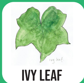
ivy leaf IVY LEAF