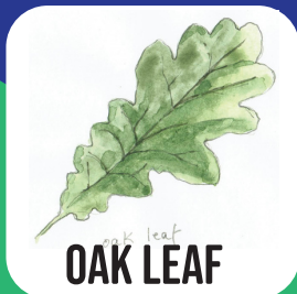
oak leaf OAK LEAF